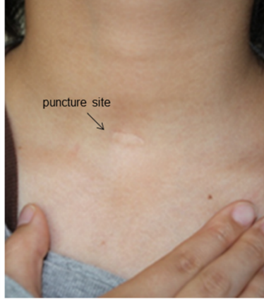
39 days after removal of the tracheal cannula